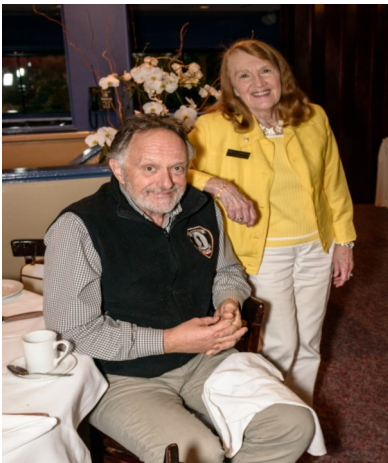
A Shoulder to Lean On