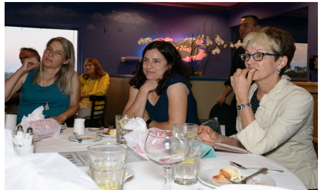
The Clean-Plate Club